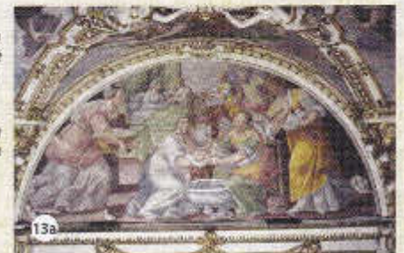
a – The Birth of the Virgin