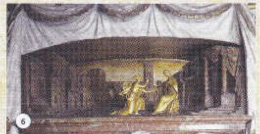
6 - ANNUNCIATION - bronze by Enrico Manfrini (1983) erected on the spot where once the (empty) sarcophagus of St. Catherine stood.