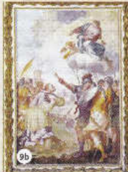
b – The Virgin's encouraging prophecy