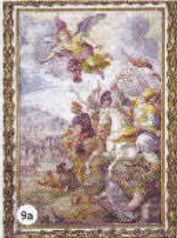
a – St. Ambrose's siege of the tower on Monte Olona