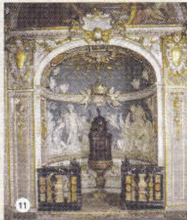
11 – BAPTISTRY – of the original from 1699 remain parapet, gate and font. Restored in 1894 by Ludovico Pogliaghi, with decorations in white and blue polished plaster with grotesque motifs. Also interesting the reconditioned original Sforzesco pavement from the 15th century.