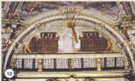
10 – CHRIST BEARING THE CROSS, inviting Romite to follow him (the nun on the right hand of the painting as seen by the viewer, is Saint Catherine). The fresco is attributed to Bernardino Butinone (1480/1490).