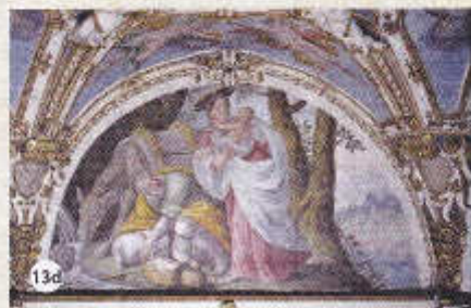
d – Rest on the Flight into Egypt