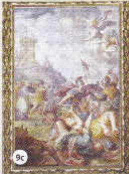
c – Battle around the tower