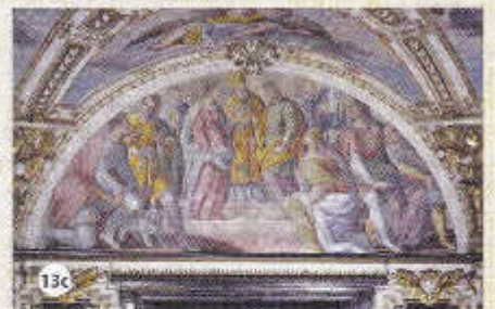
c – Wedding of the Virgin