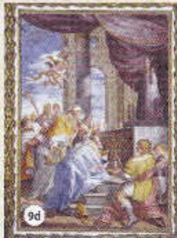
d – Solemn dedication of the mountain to the Blessed Virgin