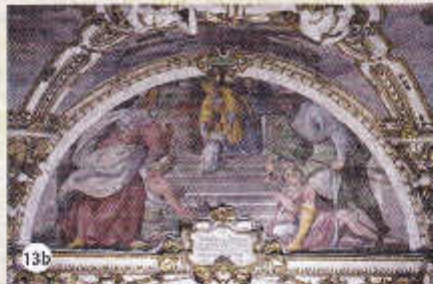
b – Presentation of Mary in the Temple